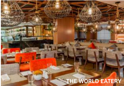
THE WORLD EATERY