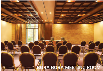
BORA BORA MEETING ROOM