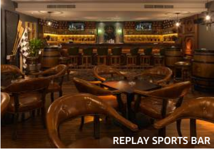
REPLAY SPORTS BAR