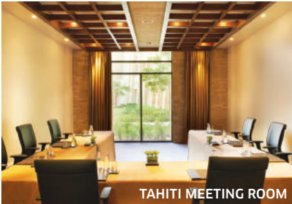
TAHITI MEETING ROOM