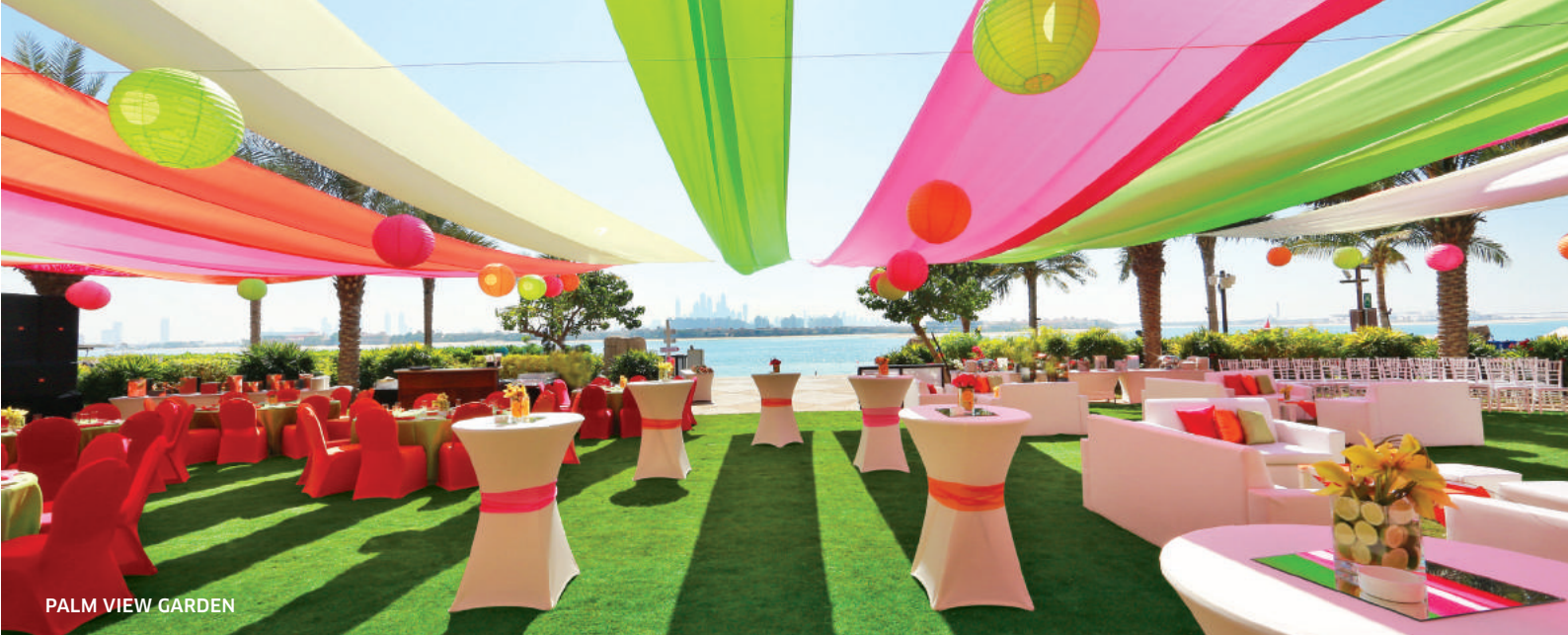
PALM VIEW GARDEN

Our magnifique lush gardens offer endless possibilities and the perfect backdrop for outdoor events. The immaculate grounds cater to fairytale tea parties, picnics with an idyllic island feel, romantic cabana dinners by the beach or barbecues on the carpeted lawn. Whatever it is that you require, our dedicated Magnifique Meetings planners will endeavour to make every aspect of your event a success.